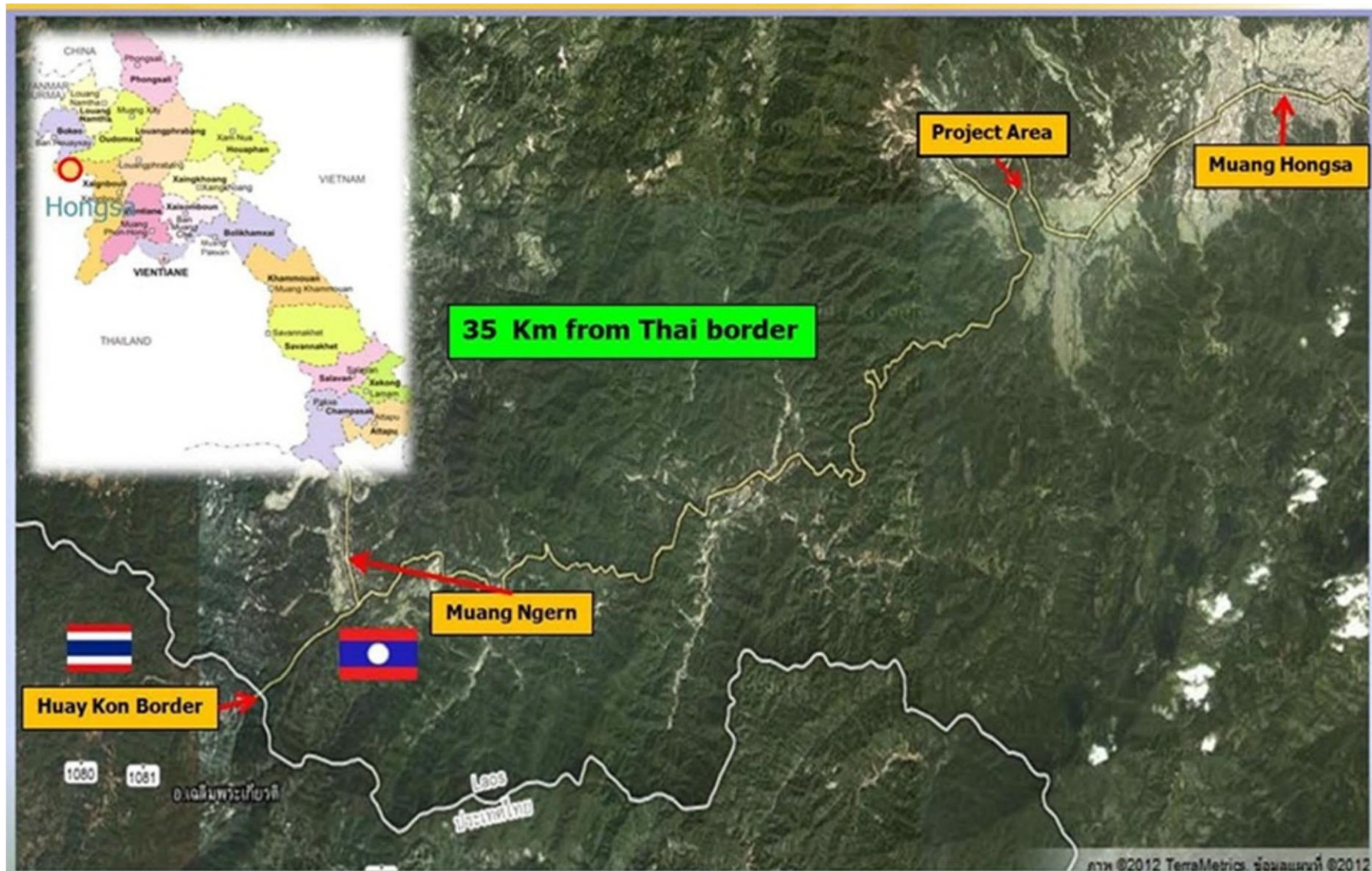
Figure 1 Location of Hongsa Power Project