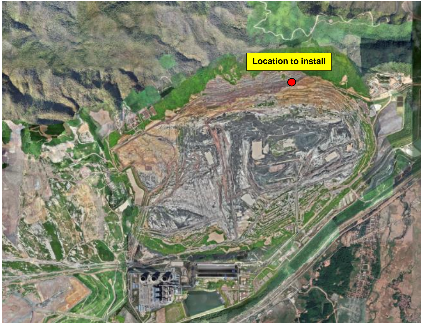
Figure 3 Location to install slope monitoring radar system